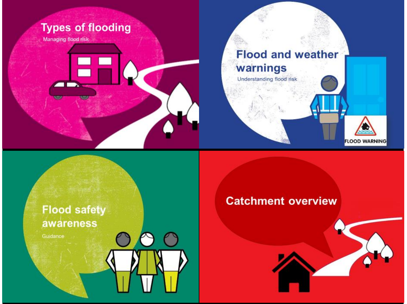
Graphics © Cornwall Community Flood Forum 2018